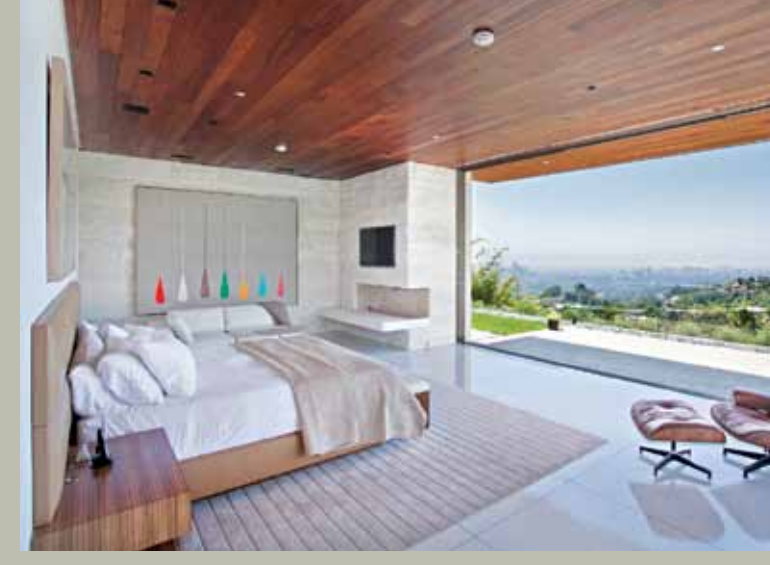
FEATURES : The refined opulence of this indoor/outdoor master bedroom perched above Los Angeles is the culmination of split-faced Portuguese limestone, paired with an Ipe hardwood ceiling and Terrazzo.